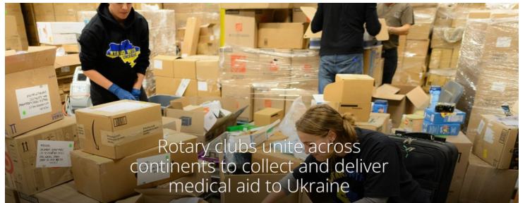
Rotary clubs unite across continents to collect and deliver medical aid to Ukraine

Rotary members in North America, Argentina, and Europe are collaborating with a U.S.-based association of Ukrainian health care workers and using their connections to collect and ship more than 100 tons of critical medical supplies to Ukraine. Two cargo planes packed with tourniquets, blood-clotting gauze, blood pressure equipment, and other items have already been flown from the city of Chicago in the United States to Europe, where members help unload the supplies and get them to Ukraine.